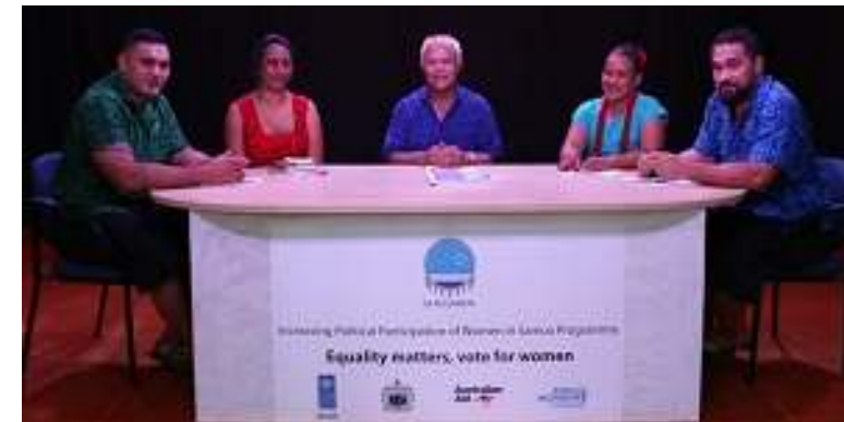
The roundtables are part of a project to increase political participation of Women in Samoa (IPPWS), sponsored by UN Women and UNDP, in collaboration with the Centre for Samoan Studies at NUS, 2016.